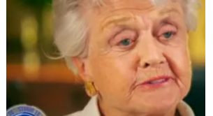
Angela Lansbury Discusses Her