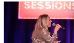
Exclusive: Stars from KINKY BOOTS Over at Bway Sessions