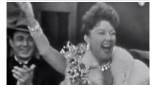
On This Day, February 15- Remem Merman