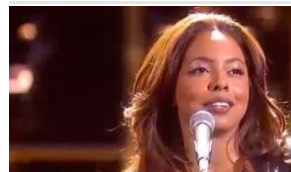
TINA Cast Performs 'River Deep, Mountain High' at the Oliviers